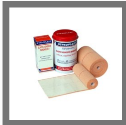
Elastic Adhesive Bandage