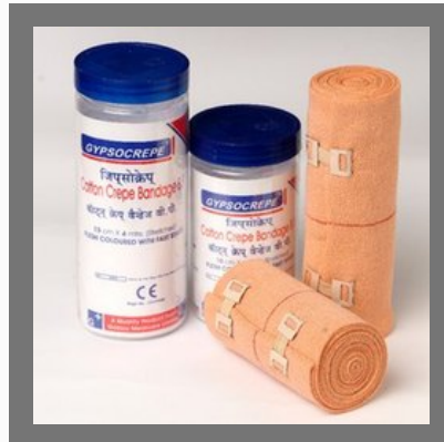
GYPSOCREPE Cotton Crepe Bandage B.P.