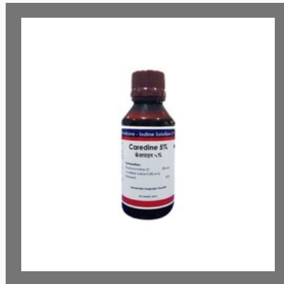
Povidone Iodine 5% 100ml