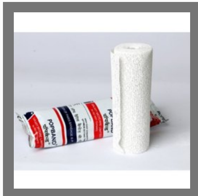
Plaster of Paris Bandage B.P.