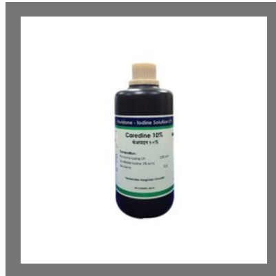
Povidone Iodine 10% 500ml