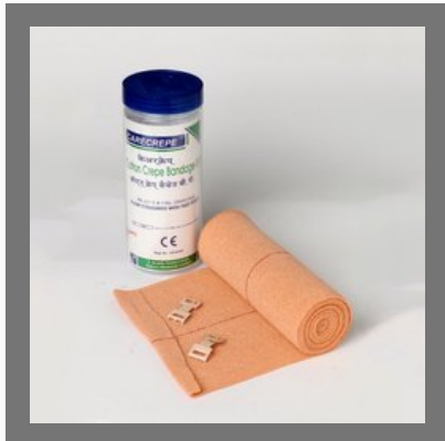
Care Crepe Cotton Bandage