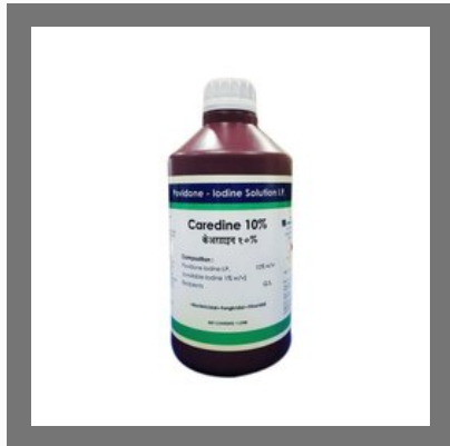
Povidone Iodine 10% Solution 1Ltr