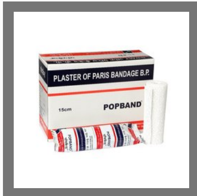
Plaster Of Paris Bandage B.P.