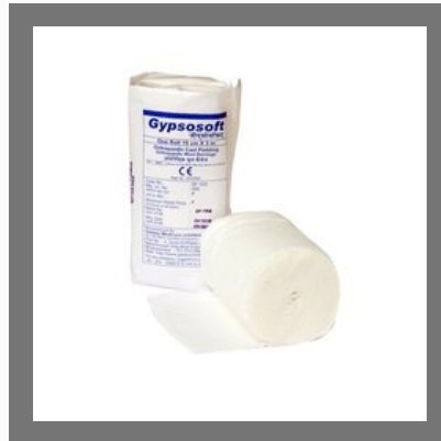
Gypsosoft Orthopedic Wool Bandage