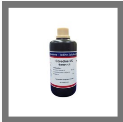
Povidone Iodine 5% 500ml