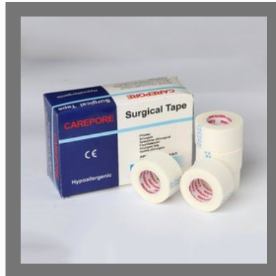
Carepore Surgical Tape