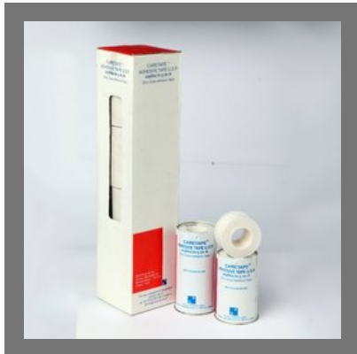
Caretape Adhesive Surgical Tapes