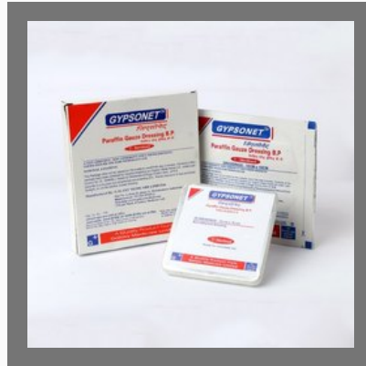
Gypsonet Paraffine Gauze Dressing B.P