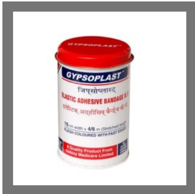
Gypso Plast Elastic Adhesive Bandage