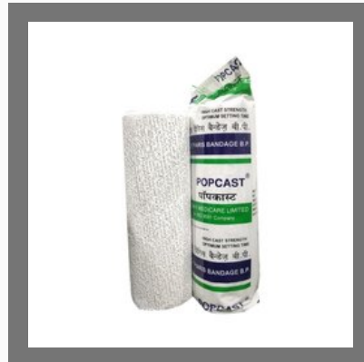
Popcast Plaster Of Paris Bandage