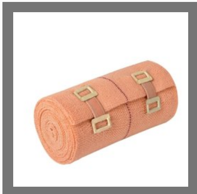
Cotton Crepe Bandages